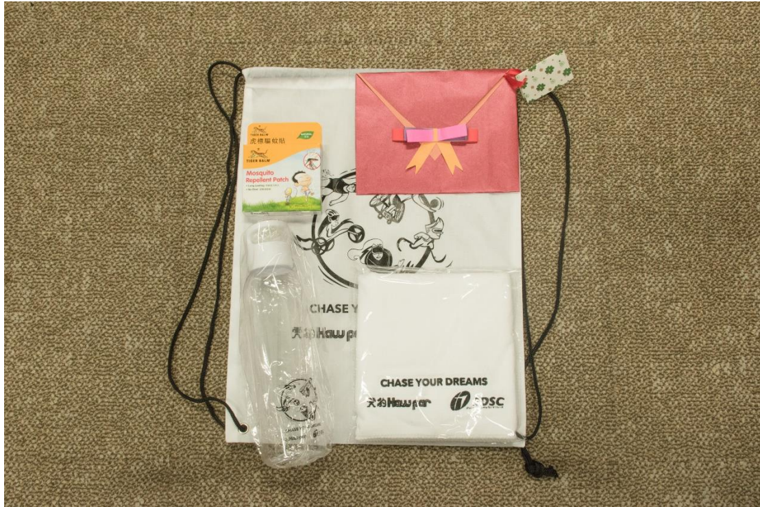
Each award recipient received a 'Back to Sport' care package.