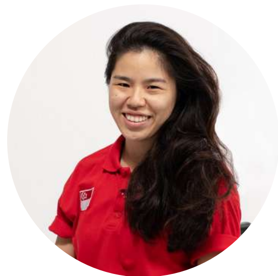
Yip Pin Xiu, swimmer

Earned Singapore's first historical Paralympic gold when she was 16.