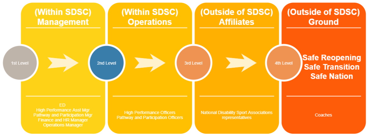
Figure 1: Appointments of SMO

1.19 SMO are appointed on four levels – management level to ensure that safe management practices are applied across the board, and operational and affiliate levels to ensure that safe management is applied in respective sports. Coaches and team managers form the final and most important line of SMO who help to ensure that safe management is applied on ground.